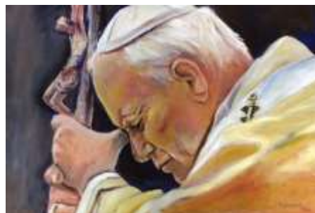
The future starts today, not tomorrow.